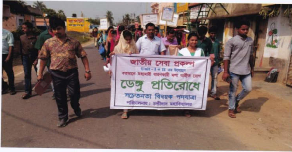
Signature of Program Officer(s) Programme Officer, NSS CHANDIDAS MAHAVIDYALAYA KHUJUTIPARA, BIRBHUM